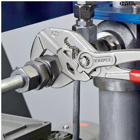
replaces the need for sets of metric and imperial spanners